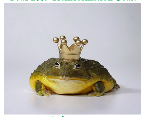
Find a way to release the royalty within.